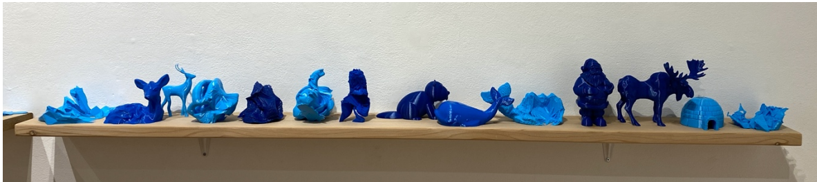
Been T[Here] series , 3D printed resin, 2022, $300 each