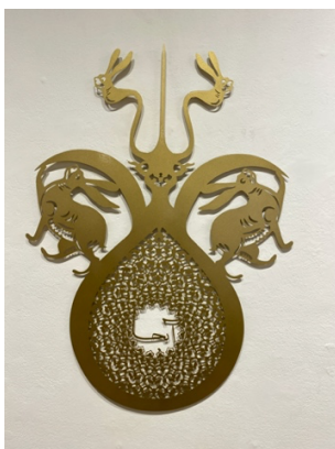
Here: Moose , laser-cut aluminum, 2022, $3500