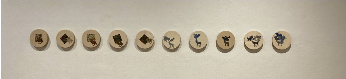
Here & There: William Morris Patterns , fabric on wood panel, 2022, $500 each

List of works and prices (left to right)