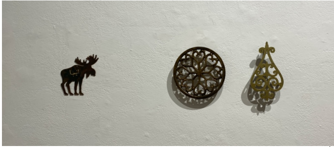
Here & There: Souvenirs , collected metal objects, 2022, $300 each