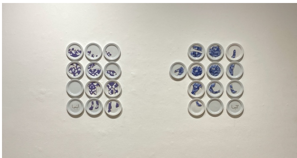
Here & There: Souvenir plates , gold luster and ceramic decals on collected ceramic plates, 2022, $300 each plate