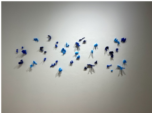
Been T[Here] series: In-Between Spaces , 3D printed resin, 2022, $150 each